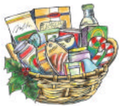
Holiday Baskets for CAMP

CAMP supplies a Christmas basket of food to families who need it in our community. Your $10 donation will be used to purchase $40 worth of food from the Atlanta Food Bank. Please write your check to Macland Presbyterian Church and designate it for CAMP Holiday Baskets before placing it in the offering plate.